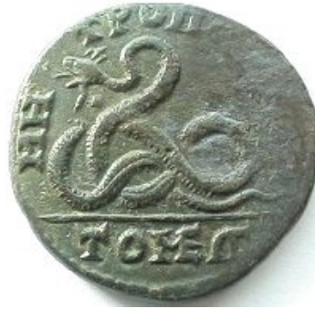
Coin bearing the image of Alexander's snake-god

losopher-emperor Marcus Aurelius sought its oracles! Just in case it is thought that this is nothing but harmless fun, the instructions in the oracle which