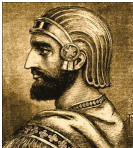
Cyrus the Great

tar of free speech or any other human rights, having ordered the closing of newspapers and imprisoning of people critical of his policies, and persecuting university professors he deems too liberal or secularist. Defending human rights is very low on his agenda.