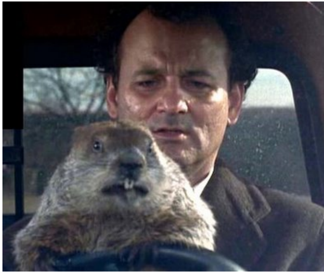
Bill Murray and furry friend

After some thinking about my thinking and lots of reflection, I realized that I could use religious holidays as a way to promote plurality instead of extremism. I have been honing my craft on each religious holiday and have escaped the Groundhog Day repetition of the past. Now when someone blurts out Merry Christmas I just smile. It makes people wonder what you're thinking. Sometimes they even ask, and that's when I say: "Have you ever seen the movie Groundhog Day ?"