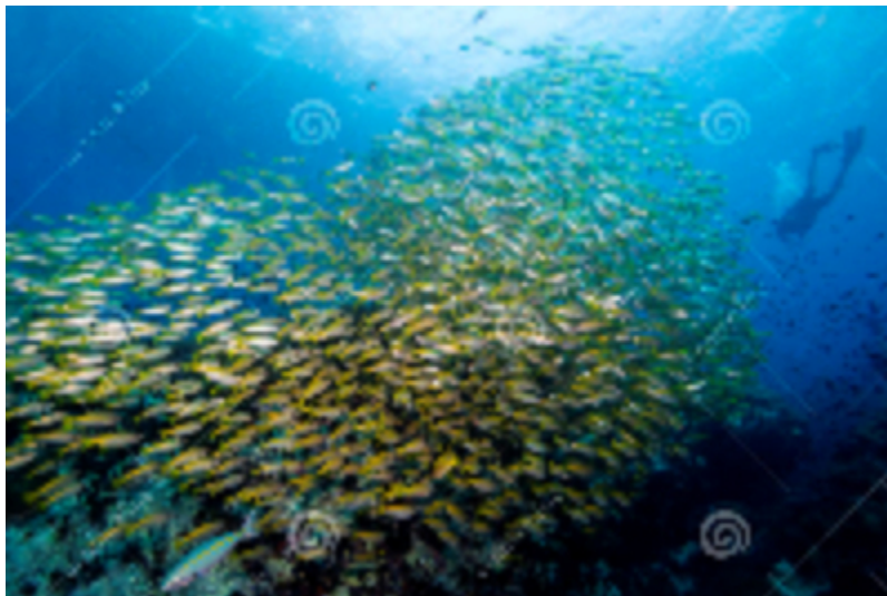
A school of tropical fish and a diver off a coast of Thailand

While climate change does threaten many species, there are nearly 8 billion human beings on this planet, more individuals than ever have been alive at anytime in the history of mankind and probably nearly a third who have ever lived. This is a staggering statistic and needs to be fully appreciated for the incredible effect it will have on this planet.